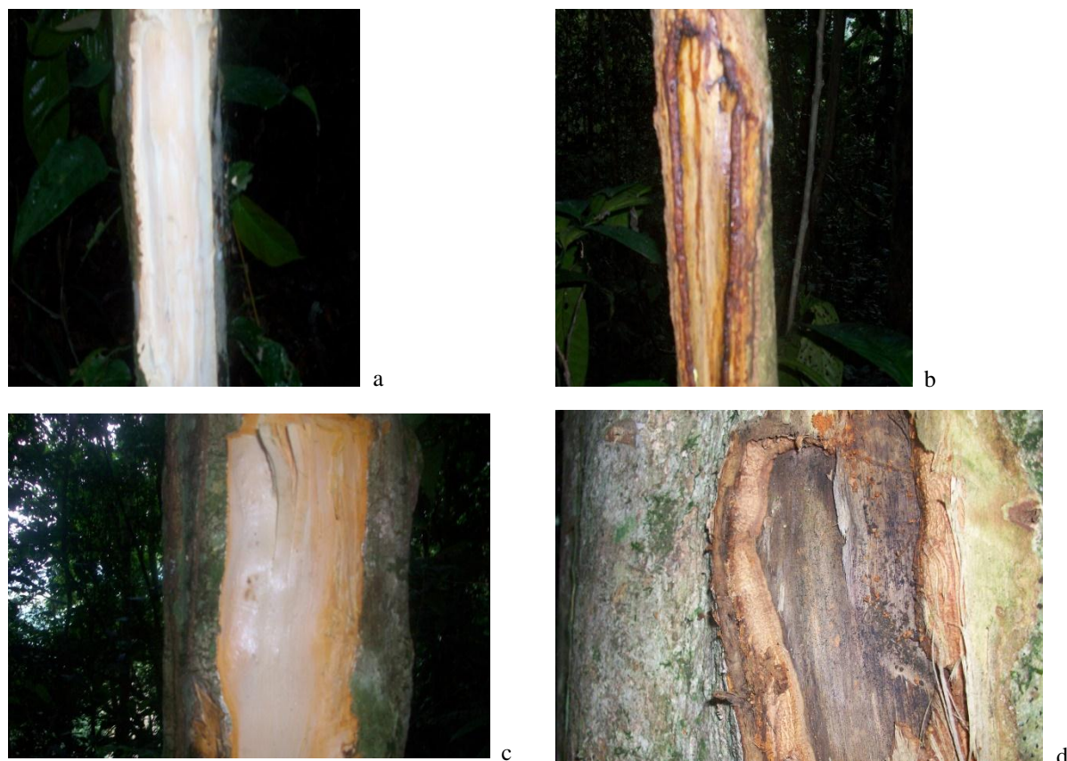
Figure 3. Macroscopic view of bark regeneration on tree stems in the Ngovayang forest a: G. lucida at the time of debarking b: G. lucida bark regrowth after 9 months c: S. zenkeri at the time of debarking d: S. zenkeri bark regeneration after 9 months