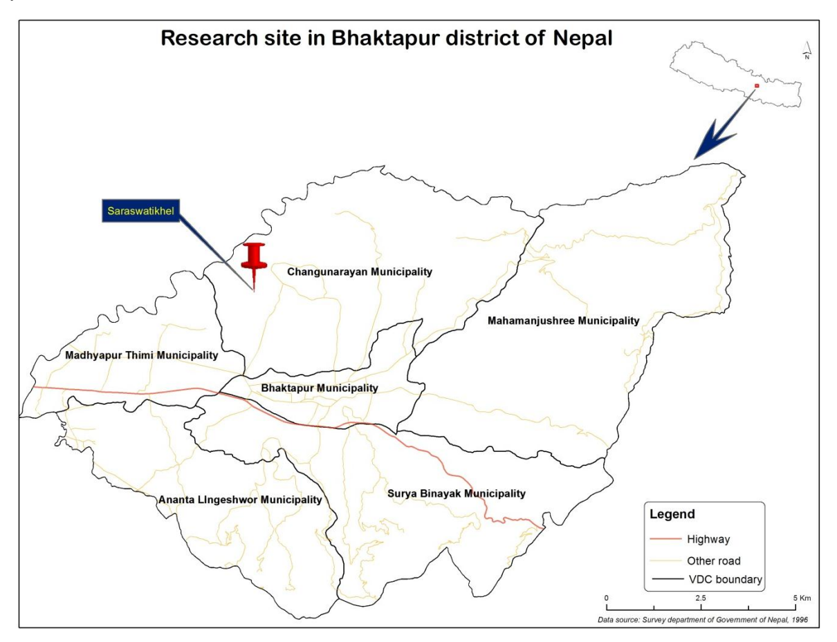
Figure 1. Map and location of the research site

1982), bulk density (BD) dry combustion method (Blake & Hartge, 1986), soil organic matter (SOM) dry combustion method (Nelson & Sommere, 1982), total nitrogen (TN) by Kjeldahl method (Bremner & Mulvaney, 1982), available phosphorus (AP) by modified Olsen's method (Olsen & Sommers, 1982), exchangeable potassium (EK) by ammonium acetate extraction followed by AAS method and cation exchange capacity (CEC) by ammonia acetate extraction method (Rhoades, 1982).