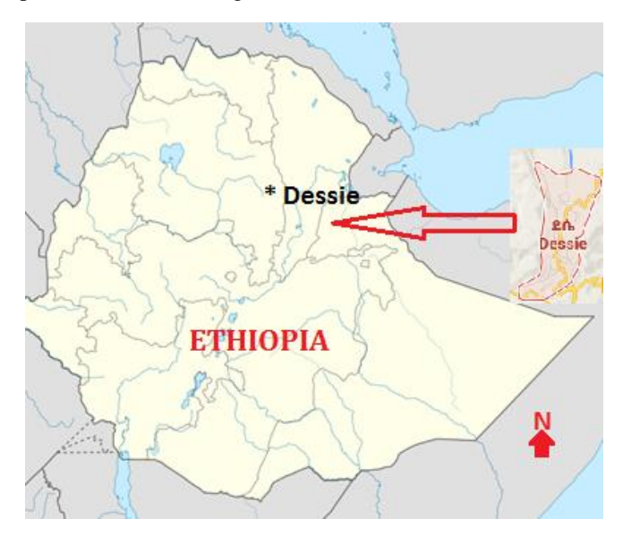
Figure 1. Ethiopia, Dessie-Town

In order to highlight the need for rainwater harvesting, this paper takes Dessie-Town as a case study. Dessie-Town is one of the top populated cities in Ethiopia (Figure 1). It is located in the north-central part of Ethiopia with a total population about 188000 and an annual rainfall about 1145mm (CSAE, 2015). Therefore, the main objective of this paper is to study the socioeconomic benefits of roof rainwater harvesting in Dessie-Town as a potential safe water resource that can cover some household's water needs and contributes in increasing household's income. According to their water consumptions, households can choose between using the harvested water for non-potable uses or for irrigation.