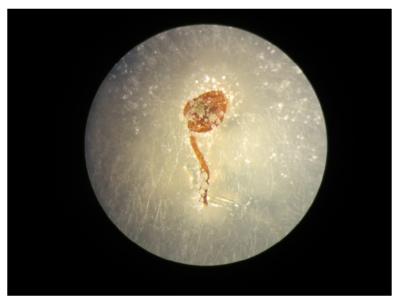
Figure 3. Gliocladium catenulatum colonizing a stamen from an apple flower