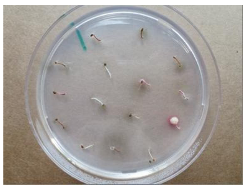
Figure 2. Stamens of apple flowers on water agar for microbial analysis

From each flower, 15 stamens were plated on water agar (Figure 2) and other flower organs (petals, pistils and calyx) on another plate (potato-dextrose agar) for the detection of Gliocladium . After 8 days incubation at room temperature, observations of G. catenulatum were made using a stereomicroscope. At the same time also fungal pathogens causing storage rot were observed by following procedures described above.