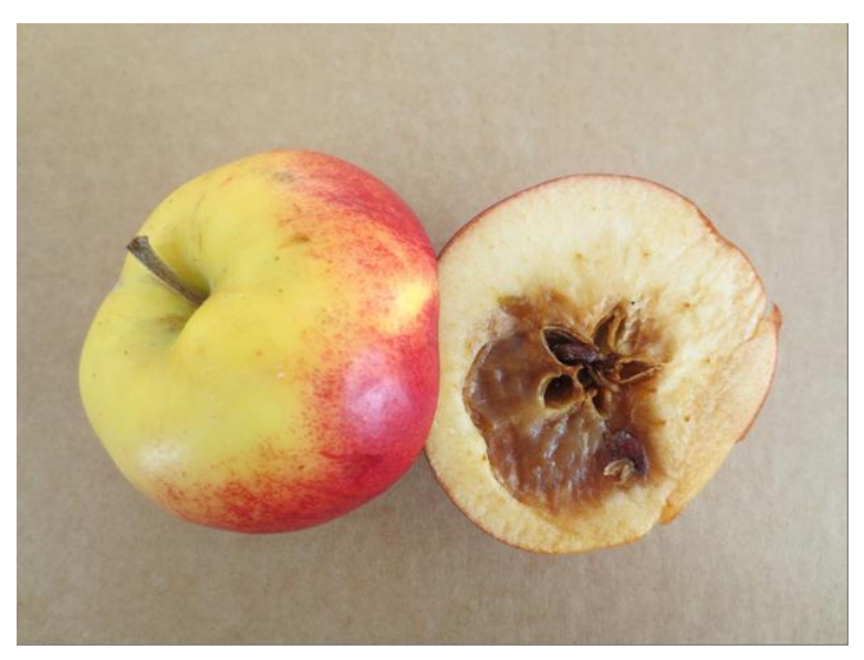
Figure 1. Core rot symptoms caused by Fusarium avenaceum on the apple variety 'Santana', which is sensitive to the disease

To our knowledge, this is the first time the entomovectoring technique has been tested on apple. The problem to be solved is a storage disease, core rot, which infects apples through the flowers. The symptoms may sometimes appear at harvest, but most often the disease occurs only after storage. Certain apple varieties, e.g., 'Rubinola', 'Gala Schnitzel' and 'Santana' are very susceptible to core rot. Appropriate chemical control of this disease is not available.