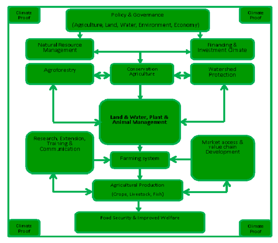
Figure 3. Congo basin comprehensive agricultural sector model