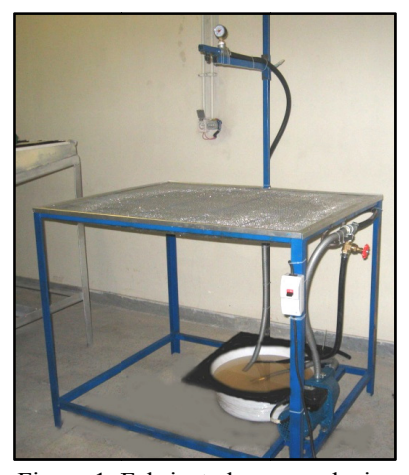
Figure 1. Fabricated sprayer device