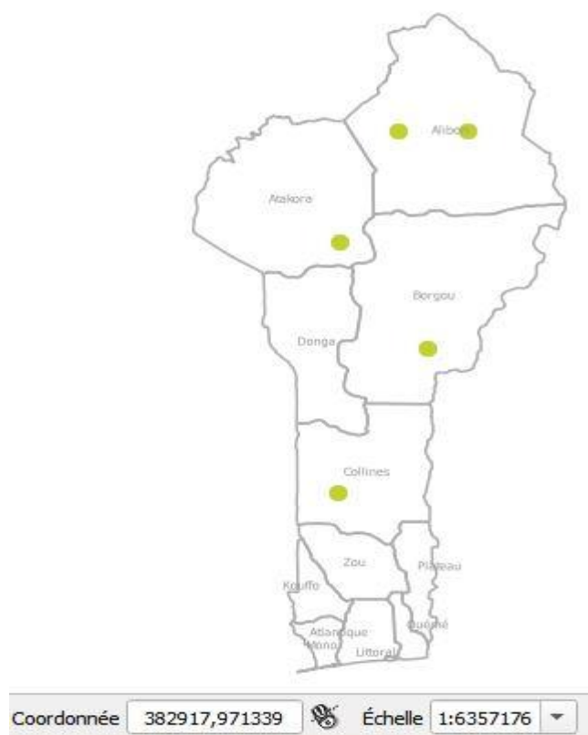
Figure 1. Geographical location of TAZCO municipalities in Benin