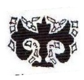
Figure 5. Akku

"Kustumsyk" ornament is shaped to make a bird's beak. It consists of curves and lines. The line in the middle is carved similar to a beak of the bird. Ornaments "kustumsyk" and "topsaly" with the single or double circle, the sun decorating girl's ring has a symbolic nature that renders justice, kindness for close-knit family relationships. To show a kind attitude towards the mother of son-in-law expressed by the girl's mother is shown by the ornament on the ring called "kudagi zhuzik". Kazakh people had a tradition to send a shawl with "kustumsyk" or "kustanday'ornaments" to inform relatives about the birth of a child.