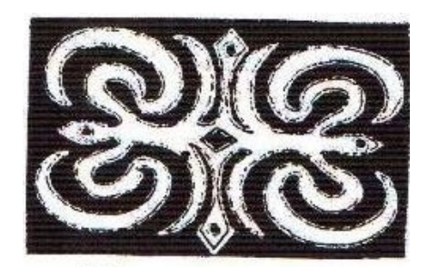
Figure 6. Zhylanbas

"Zhylan", "Zhylanbas" ornaments feature in many clothing national items of children, especially in hats to turn away the evil eye and it resembles a snake's head. It is strongly believed that the image of the snake is helpful in protecting people from a bad evil energy. Snakes are a long limbless reptile which has no eyelids, a short tail, and jaws that are capable of considerable extension (Explanatory dictionary, 2008).