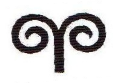
Figure 7. Orkesh

"Orkesh" (camel's hump)—a fleshy protuberance on the back of a camel (Explanatory dictionary, 2008). As it looks similar to a camel's hump it was so called. Orkesh ornament is used for wishing prosperity and reproduction. In Kazakh ornamental art double horned cattle, two humps of camels, double breast of mare can also symbolize a symmetric equilibrium.