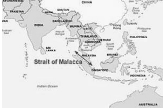
Figure 2. Malakka straits