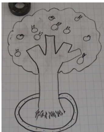
1. Before - in the Engagement phase

The findings in the Exchange phase are consistent with the findings in the Follow-up phase, in which the students were asked by the teacher to assess the drawings made in the Engagement phase. The students recognised the inappropriateness of the root systems in the drawings of the plants they had made before being involved in the inquiry activities of the Experience phase and the discussions of the Exchange phase. In the Follow-up phase, they proposed solutions to adjust the drawings, as shown by the example drawings presented in Figure 2.