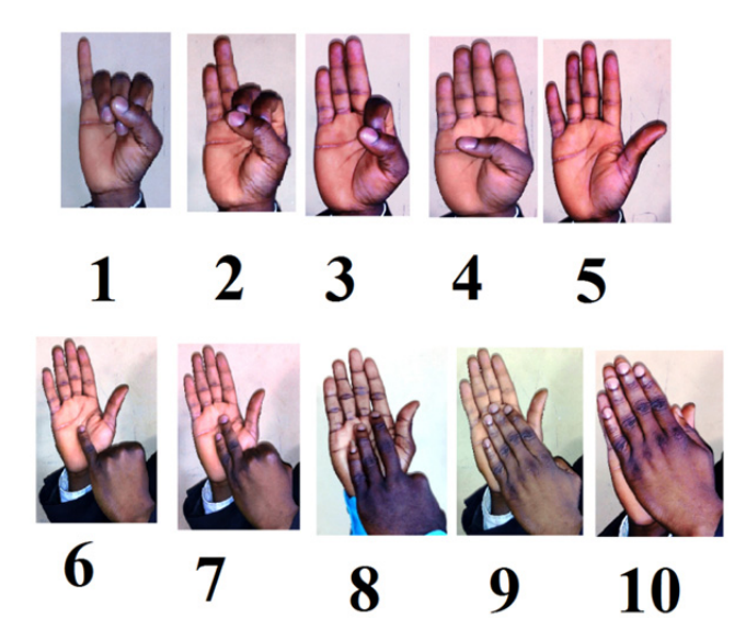
Figure 1. SamplesofDataset Used in the Research

Data from 60 subjects (signers) were collected and utilized for the study. Each subject generated 10 samples of each static one to ten Figures (600 total samples). The data were subsequently used to evaluate the performance of both models. In order to acquire data, the vision-based sign extraction method was used. This was achieved by fetching an input image based on a camera. Figure 1 shows the samples of gestures created for the dataset. To create a gesture system database, the gestures were selected along with their connotations, in which each gesture contained various samples to increase the accuracy of the system. Vision-based method was chosen because it is user friendly and popularly used in sign recognition systems. A fixed camera in front the signers were used to capture the sign gesture. Posture features of the fingers and palms were further extracted. After the data were collected, the images passed through different stages of image processing technique in order to enhance the quality of the image