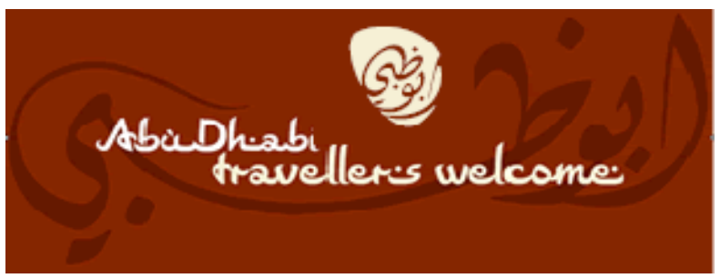
Figure 2. Abu Dhabi "Travellers welcome" initiative's logo

The office of the brand-marketing in Abu Dhabi (OBAD) concentrates on differentiating the emirate of Abu Dhabi from the emirate of Dubai, where the identity of Abu Dhabi was known in the past for being the conservative neighbor of Dubai, whereas for the identity of Dubai is the city of superlatives (Beauregard, 2003). The ambition was to address the new identity of the country as "the country's livable, cultural and sustainable capital". Thus, the main duties of the OBAD were helping both the private and the governmental sectors to realize the core value and the vision statement of the emirate's brand, and clarifying their role by collaborating to support the branding strategies.