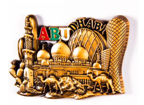
Figure 1. Fridge Magnet Featuring Abu-Dhabi (Adapted from Worldwide Souvenirs website: https://www.world-wide-gifts.com)