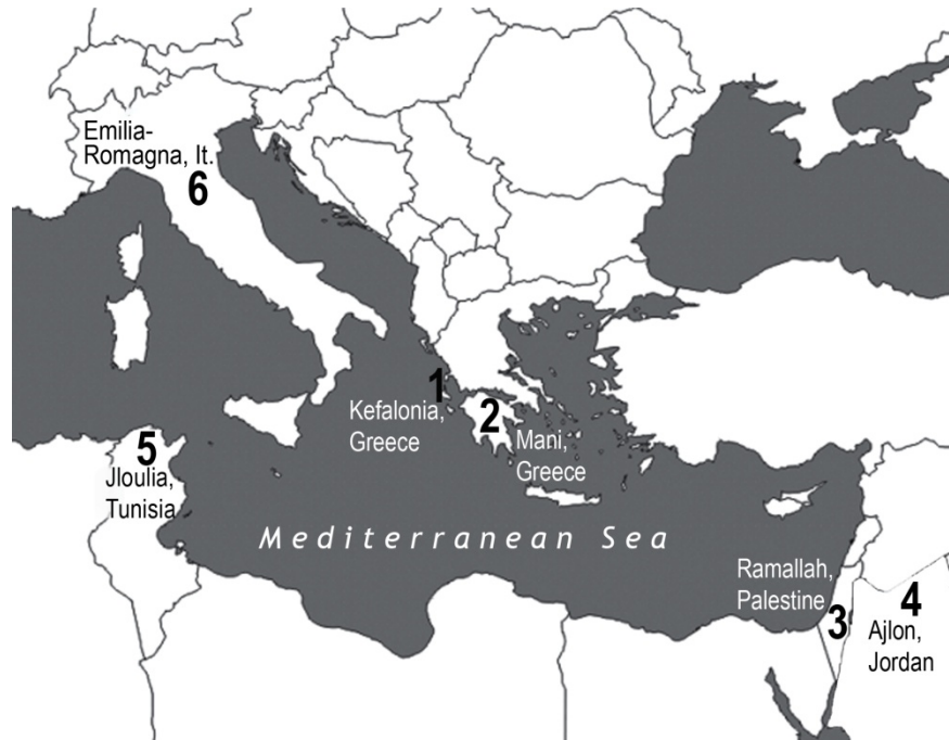
Figure 1. EuroMed cooperating farming communities in the Mediterranean Region