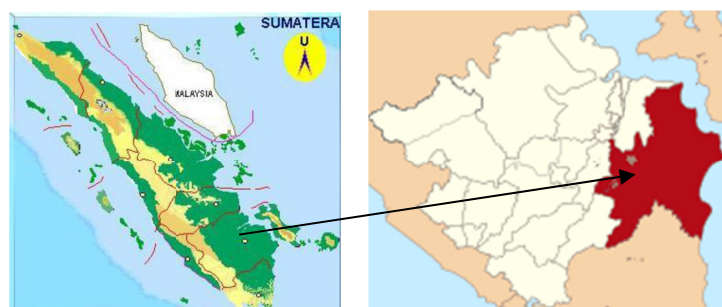
Figure 1. OKI District in South Sumatra Province, Indonesia

This research has been conducted in peatlands of OKI (Ogan Komering Ilir) district, South Sumatra Indonesia (Figure 1) and carried out from July to December 2017. Field survey has been carried out to obtain data and facts from the existing conditions and look for factual information about bio geophysical aspects of peatlands, social, economic and political institutions of farmers. Rural patterns of peatland-based livelihoods were determined as research subjects and farmers from these livelihoods were taken as respondents. The respondents were determined by using stratified random sampling technique and comprehensively interviewed. Primary data were collected directly from the field with questionnaire and secondary data were taken from related institutions, NGO (non-governmental organizations) and oil palm companies. Data analysis conducted by this research was based on qualitative and quantitative approach, performed and analyzed in forms of tables and descriptions.