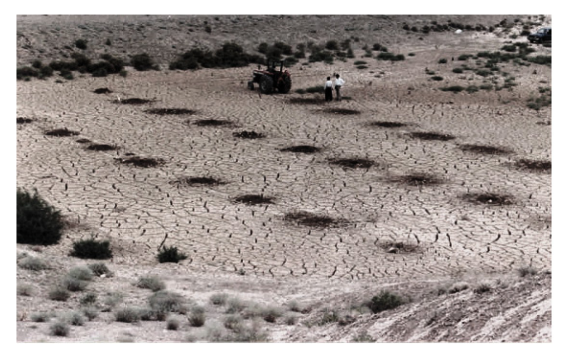
Figure 2. Examples of the profile pits