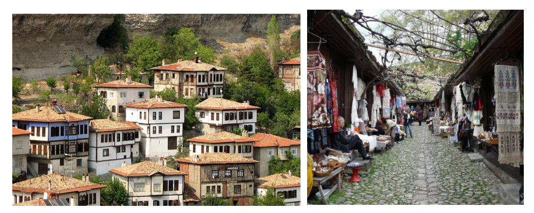
Figure 2. Safranbolu, Turkey, (URL-5)

In Turkey, Safranbolu and Beypazari are some of the important samples. In the same way, Cumalikizik village that includes the examples of early life countryside civil architecture of Ottomans as a district of Bursa and Odunpazarı of Eskişehir can be shown among the settlements which have these characteristics (Figure 2).