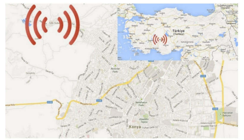
Figure 3. The location of Sille in Turkey and Central Anatolia region (URL-2, 2015)

Sille which is located in Central Anatolia region on the northwest of Konya city is far from the city center about 8 km (Figure 3). Sille is a settlement that has cultural and ethnic diversity in urban fabric with cultural assets consist of mosques, churches, monasteries, baths, bridges, fountains, traditional houses and bond houses belong to Seljuk and Ottoman periods (Aklanoğlu, 2009).