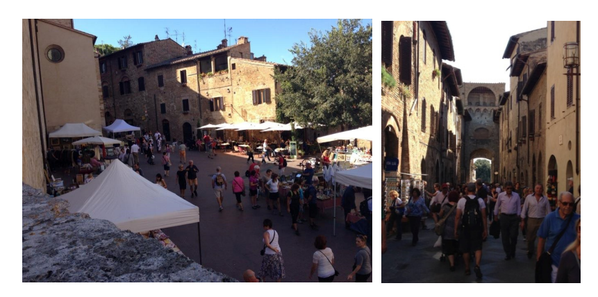
Figure 1. San Gimignano, Italy, (Ertaş, 2013)

In Turkey, Safranbolu and Beypazari are some of the important samples. In the same way, Cumalikizik village that includes the examples of early life countryside civil architecture of Ottomans as a district of Bursa and Odunpazarı of Eskişehir can be shown among the settlements which have these characteristics (Figure 2).