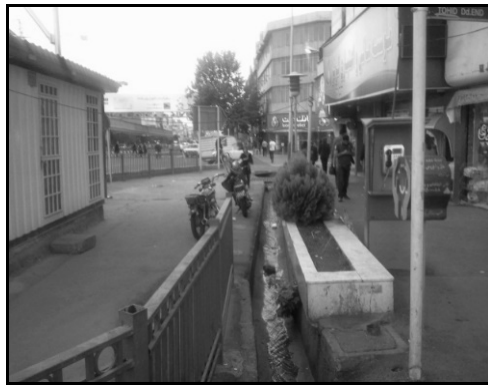
Figure 5. The study area (Authors)