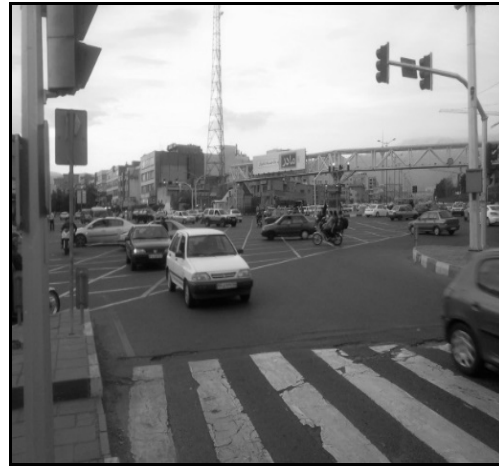
Figure 4. The study area (Authors)