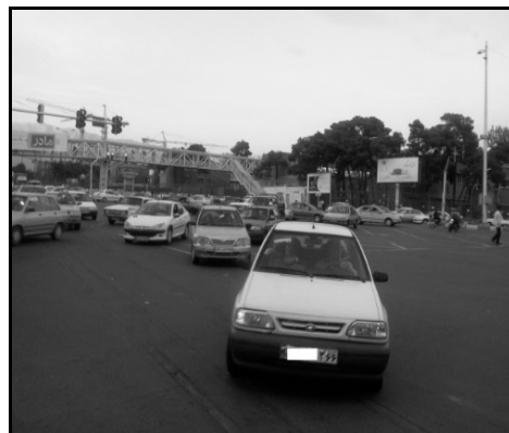
Figure 7. The study area (Authors)

As it was said, effective indices on presence or not –presence of citizens in urban spaces are presented in Table4