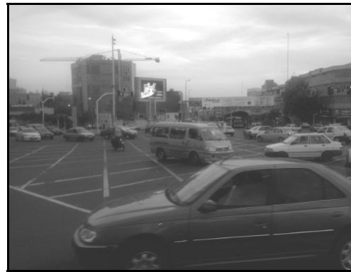
Figure 6. The study area (Authors)