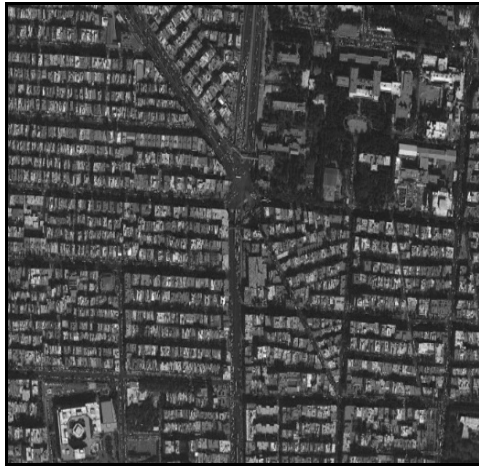
Figure 3. The study area (map.google.com)