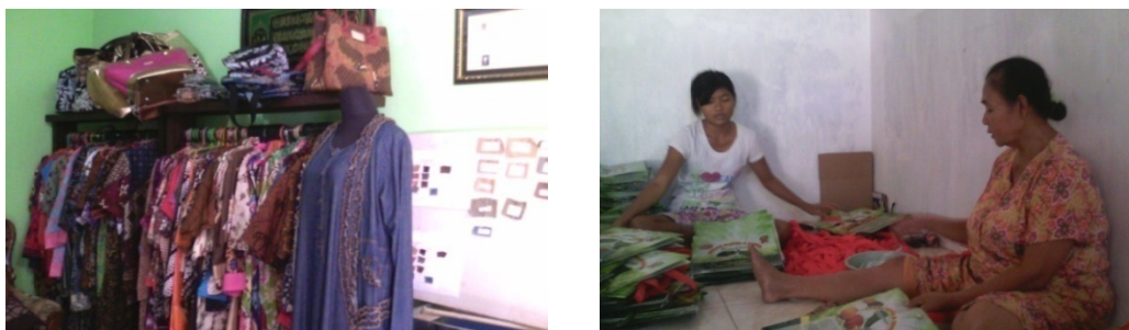
Figure 2. Creative economic activities in Kampong Talun Kacang, Kandri

Prospects for a positive distribution of benefits can be seen in the area. Kandri villagers who live in Kampong Talun Kacang, the nearest to the cave and the reservoir, have started developing related business activities such as renting rooms known as homestay accommodation for the tourists. There has also been a community empowerment program as part of the Kreo Cave tourism development. It has helped to initiate two community groups that are concerned with tourism development called Pokdarwis (an acronym of Kelompok Sadar Wisata , which means Tourism Concerned Group). The groups facilitate creative economic activities that have been developing as seen in Figure 2. Since an equitable distribution of development benefits is one of the prerequisites to ensure sustainable development according to the model of Equity-Based Development (EBD) (Sugiri, 2009), it is thus essential to examine this function in Kandri Village.