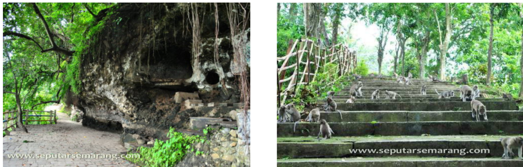
Figure 1. Kreo cave and the environment