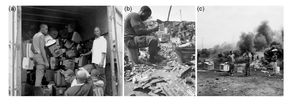
Figure 1. Dumping e-waste in African regions: (a) workers at e-waste dumping site (Alaba) in Nigeria, (b) sorting e-waste in Ghana, and (c) e-waste burning in South Africa

of who exports e-waste to Africa - end-of-life devices are exported through illegal network by brokers in an unreground market (Schmidt, 2006). An example in Nigeria is reported in BBC News (Carney, 2006) as follows: in custom documents, electronic equipment at the end of its useful life is described as being "shipped for re-use". This category of re-use category raises their profits and reduces their responsibilities for environment and safety. The brokers intentionally mix bad devices (i.e. useless junk) with good ones so that they can evade disposal and/or recycling costs. This trade results in huge waste piles in the countryside (Schmidt, 2006; also see Figure 1).