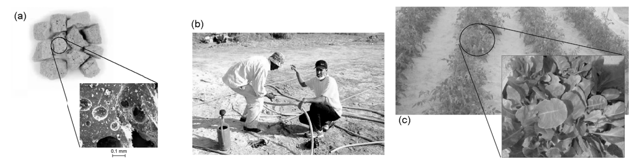
Figure 3. Demonstration test for application of waste-based foam glass to crop cultivation in the Sahara desert of Mauritania: (a) grains of waste-based foam glass (size of \sim 1.0 mm) and microscope image of its porosity; (b) preparation of test field, and (c) tomato cultivation (2-cm layer of foam glass amendment).

A demonstration test has already started to prove the application of waste-based foam glass to desertification greening in the Sahara desert of Mauritania (Figure 3).