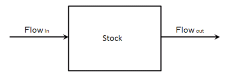
Figure 1. The box model demonstrating the concepts of stock and flow

Each sub-system of the Earth can be described as a box, where materials such as carbon and water are reserved ("stock"), and which flow in/out of the other sub-systems ("flow") (Matsui, 1998a). Figure 1 shows a schematic model of material stock and flow. The anthroposphere is utilizing material and energy flows within the Earth system to maintain its activities. Preindustrial agricultural society is a flow-dependent civilisation, whereas industrial society is a stock-dependent civilisation, which has enabled rapid expansion and accelerated human activities, in not only manufacturing and commerce but also agriculture itself. A flow-dependent civilisation is stable and has a longer lifespan, since its material and energy use is embedded within the biosphere. Conversely, a stock-dependent civilisation has a shorter lifespan, since it relies on a finite amount of accumulated stock generated in the past to drive its material and energy flows.