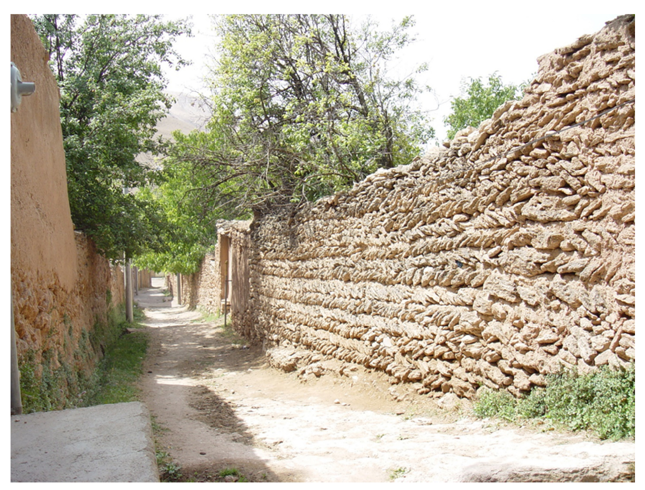
Figure 1. The historical context of Zonouz and the technique of using rubble trench in the partitions facing the passage

Historical contexts are considered as the inevitable fact of the cities with historical background. They were the member of city in the past including the material and spiritual business and traffic of people at that time. In other words, old urban contexts are creative places for understanding the place of human in the world and its association with the past. They are the places for changing the environment and attitude to the current and future life (Habibi, 2006). Partitioning the historical context in general and Zonouz in particular depends on the rules which should be studied for achieving the ideas and concepts to protect the urban and historical identity and originality of the current parts leading to urban restoration.