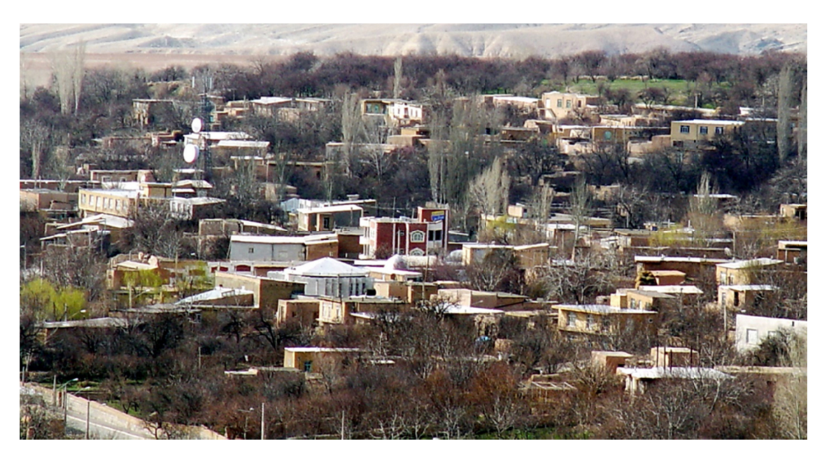
Figure 4. The prospect of Zonouz (The alienation of modern buildings with traditional buildings and landscape destruction is obvious)

The natural materials and colors used in buildings' façade, the controlled light emitting through the foliage, and even the audio attractions due to the wind passing among the trees in alleyways can be added to the quality of urban environment in Zonouz.