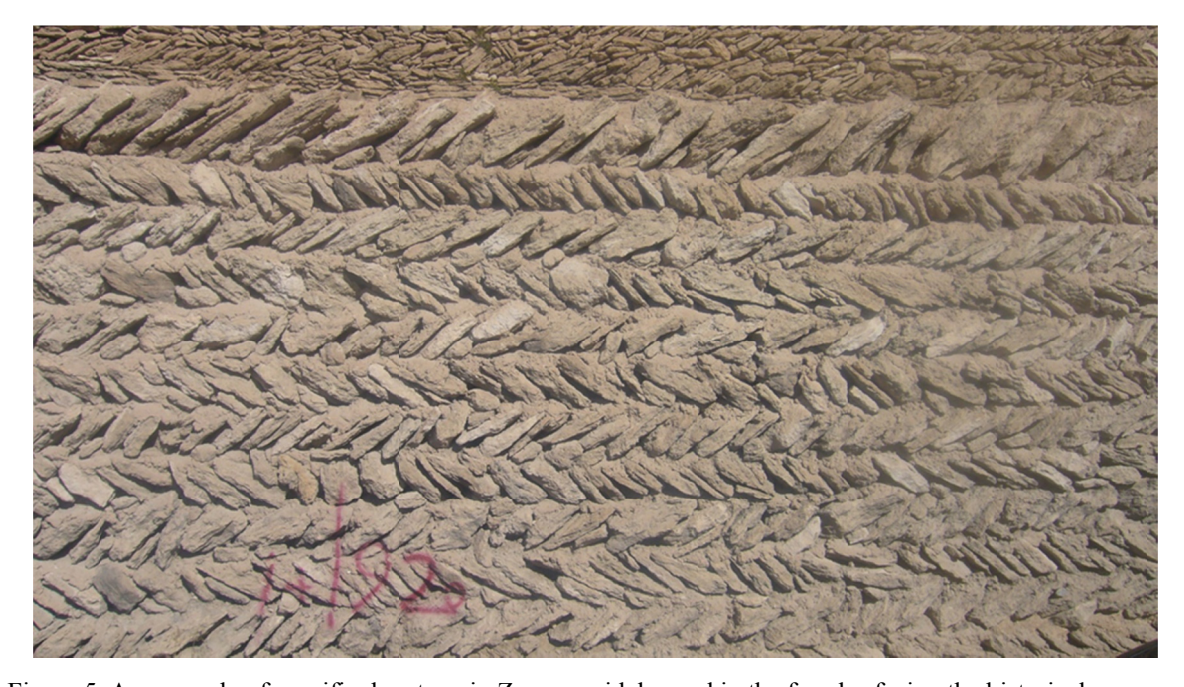
Figure 5. An example of specific dry stone in Zonouz widely used in the facades facing the historical passages

Except the alleyways of the traditional context mentioned in part A, other public spaces of Zonouz included modern streets and squares. The streets were constructed among the historical context and a new elements with old architecture or a few examples of specific rubble trench in Zonouz can be gradually observed over time (Figure 5). It has no visual attraction. The modern squares of Zonouz, except the central square, have the vitality value due to their location in their specific place in the context center. Other squares with scattered spaces without limitation act merely for presentation in the urban environment.