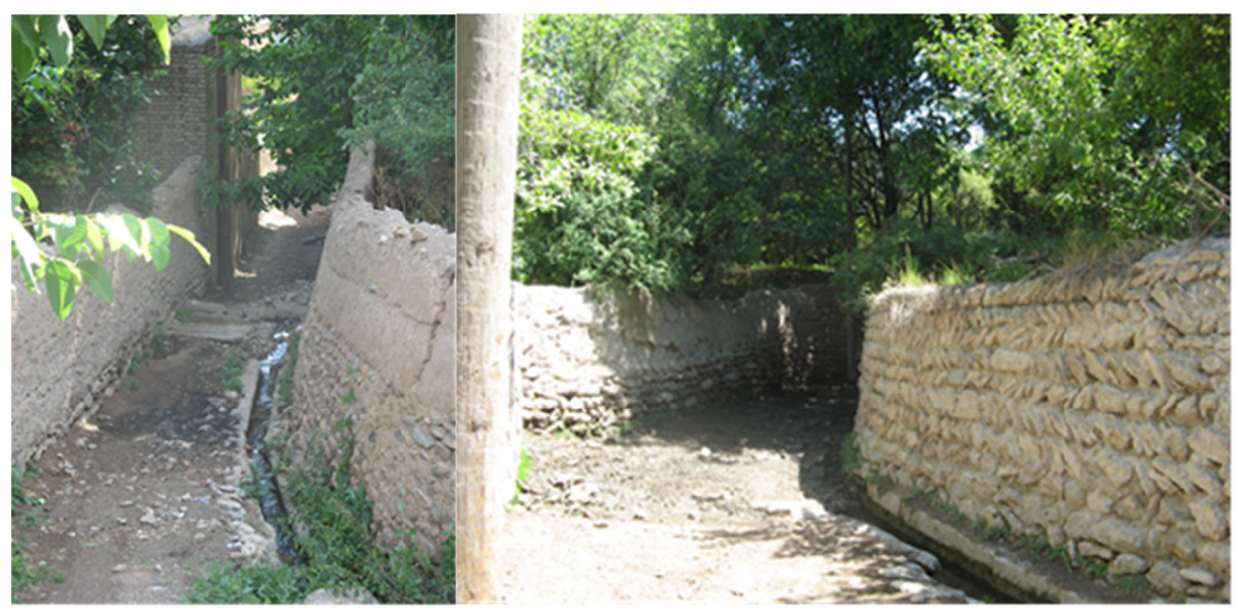
Figures 2 and 3. The effects of natural factors like the passage of passing streams on the formation of passages

The most important factor of the city linear formation is due to its topography that the slope is mainly to west and southwest. The surface water is easily discharged due to the appropriate slope. The direction of surface water discharge is mainly to the west due to the south slope. The significant point in surface water discharge is the arrival of surface water discharge streams into the residential gardens. This specific system was created due to different springs in the city and using their water traditionally by the residents over time to irrigate the gardens.