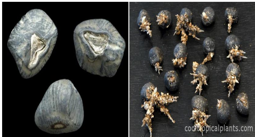
Figure 1. The Seed Biology of Enset

There are usually 15-25 very hard, black seeds per fruit, although numbers vary from 0-40. The seeds are embedded in an edible but tasteless orange pulp and vary in size (1.2-2.3 x 1.2-1.8 x 0.9-1.6 cm). They vary in shape from nearly spherical to flatten and irregular, and from deeply striate (grooved) to almost smooth (Fig 1) ( http://www.kew.org/science_conservation ). The germination of Enset Ventricosum seeds is not an exact science. There were many theories stated around as to what is the best technique. The freshness of the seeds would appear to be more important than other factors. Two reliable methods to germinate your seeds are germinating seeds in pots and using the Baggie method. The germination of the Enset Ventricosum is somewhat erratic. It cannot depend upon plants germinating this year for the current garden plan. Growing Abyssinian bananas in succession and therefore knowing what we have in stock makes planning your garden easier ( http://www.cooltropicalplants.com ).