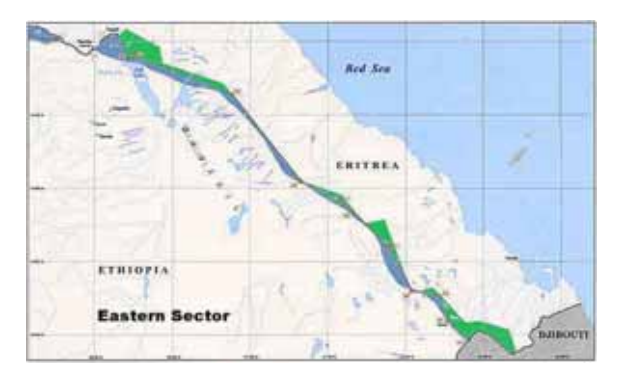
Figure 6. EEBC Decision - Eastern Terminus