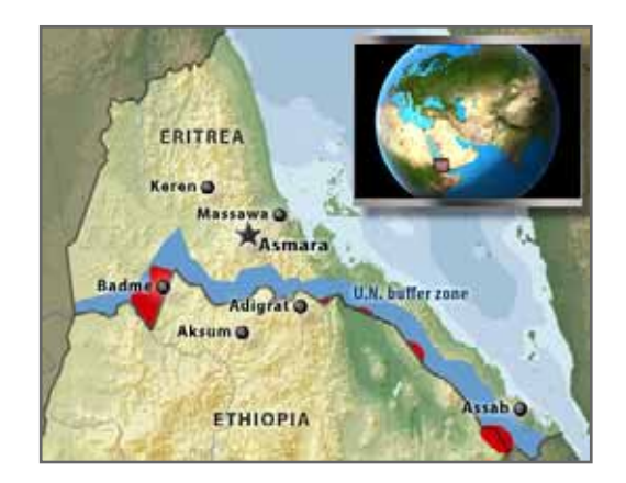
Figure 2. The Eritrean-Ethiopian Border Conflict