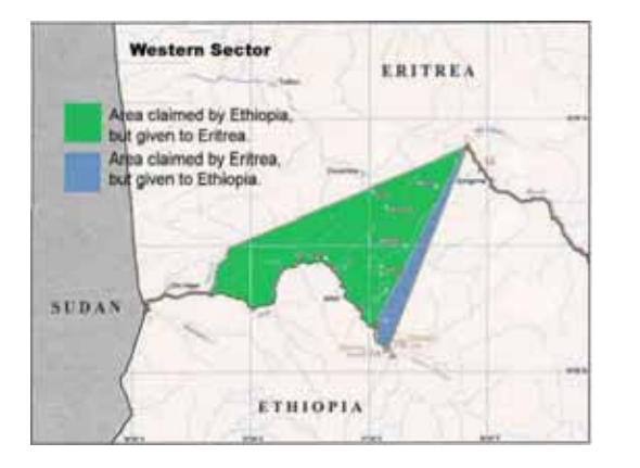
Figure 4. Decision of the Ethiopia-Eritrea Boundary Commission (EEBC) at the Hague, 13 April 2002 – Western Terminus