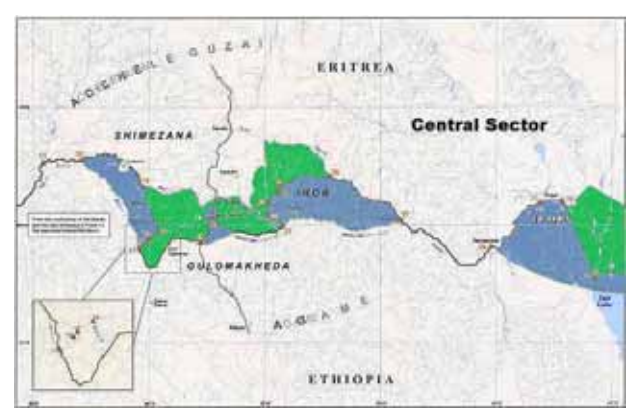
Figure 5. EEBC Decision – Central Terminus