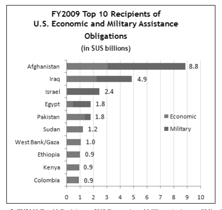
Figure 2. FY2009 Top 10 Recipients of US Economic and Military Assistance Obligations