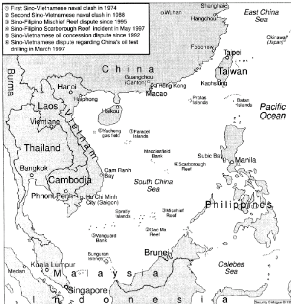
Figure 2. The Clashes between China and Vietnam, and China and the Philippines (Ji, 1998)

From the external reasons, realists hold that the ASEAN claimant states, having their own national interests, feel under threat of China. Thus these countries and China are in a non-sum competition, seeking for the superiority of power over others. Military clashes are simmering. Once there is some 'over-acting' of China, military conflicts between China and the ASEAN claimant countries, would be probably triggered.