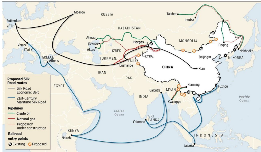
Source: The Wall Street Journal (2014). Retrieved from http://www.wsj.com/articles/chinas-new-trade-routes-center-it-on-geopolitical-map-141559290