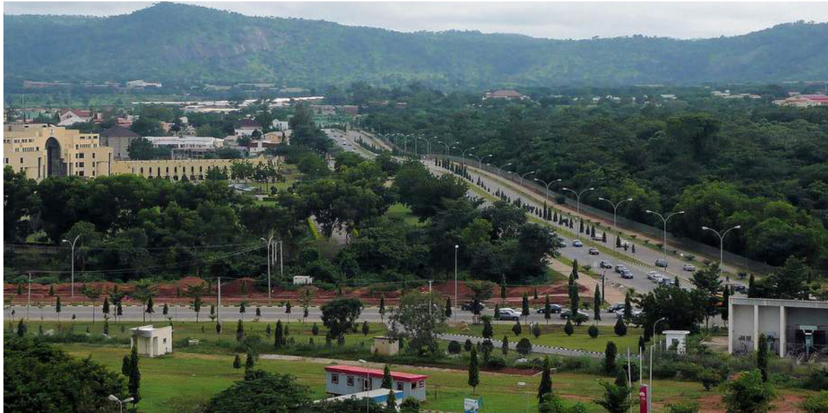
Figure 1(c). Road Network in FCT, Abuja North-Central Region of Nigeria