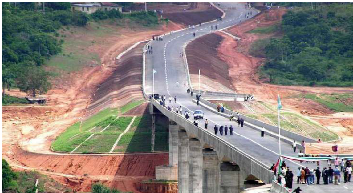
Figure 1(b). Road Development in North-Central Region of Nigeria