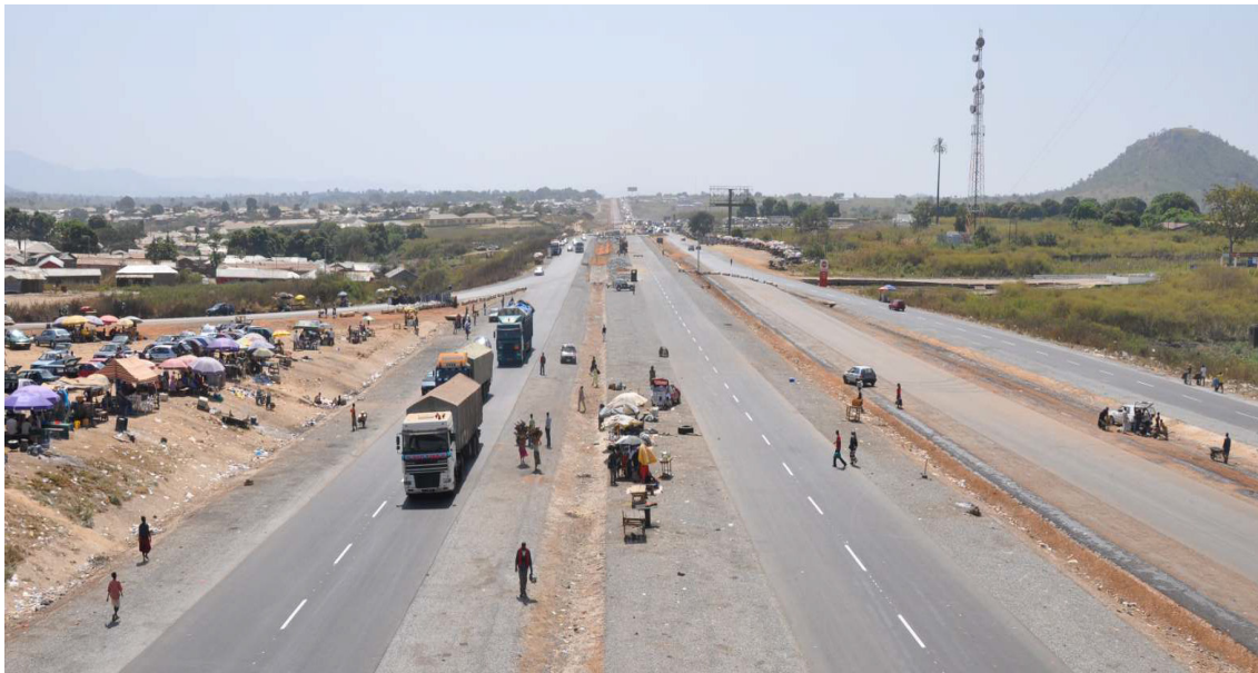
Figure 1(a). Road Development in North-Central Region of Nigeria (Abuja-Lokoja Dual Carriage)

The policy is to assure investors in infrastructure development that all contract completed in compliance with the ICRC Act will be legal and enforceable, and that all the investors will be able to recover their expected return subject to compliance with the terms and conditions of the PPP contract. See figures 1a, 1b, 1c and 1d for road development in North-Central region of Nigeria.