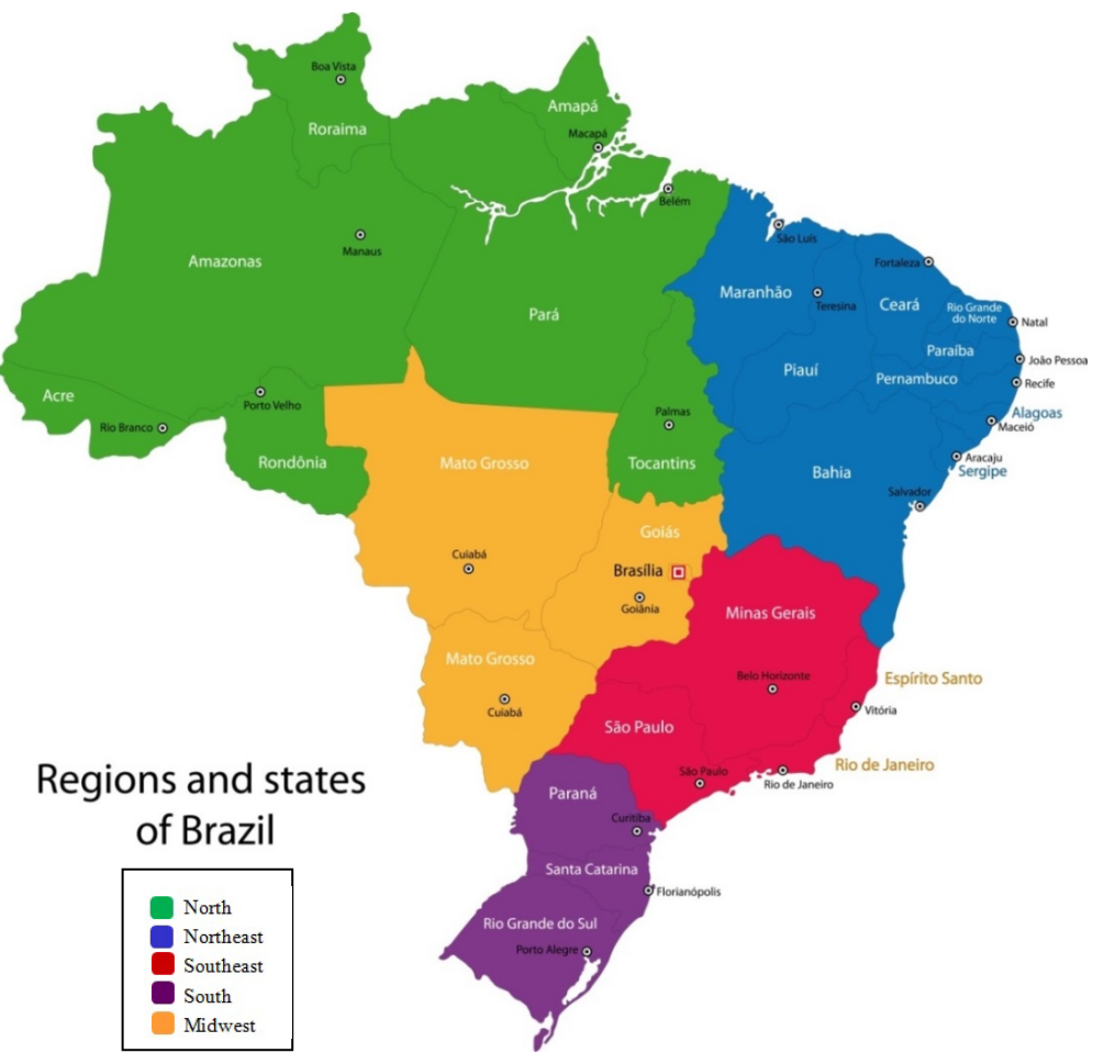
Figure 1. Political regions and Brazilian states

It is important to add that there are, in Brazil, four different time zones, as well as different climatic regions (equatorial climate, tropical climate, temperate climate, subtropical climate and semi-arid climate), which must be taken into account in the different construction practices. In this context, the global interest in sustainable development in the construction industry in Brazil is promising. The country is divided into 8 bioclimatic zones according to NBR 15220 (ABNT, 2008), in which limit parameters for major Brazilian cities were studied and recorded in this standard, namely: maximum daily temperatures, thermal amplitude, wet bulb temperature, solar radiation and cloudiness. This Brazilian bioclimatic zoning also includes a set of recommendations and constructive strategies aimed at single-family homes of social interest, in order to make them more livable and sustainable.