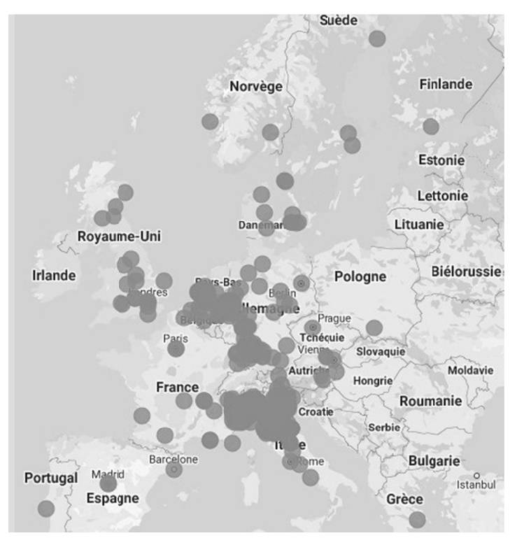
Figure 2. Concentration of geographic areas with LEZs in Europe (2020)

Source: www.urbanaccessregulations.eu (Accessed November 30, 2020)