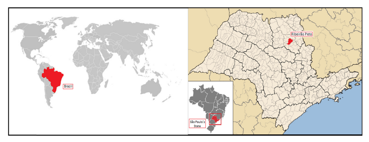
Figure 1. Identification of the subject of study - Ribeirão Preto, Brazil

The study area of this research is the municipality of Ribeirão Preto, located northeast of the State of São Paulo, Brazil, 313 km from the capital São Paulo city. The total area (urban and rural) of the municipality is 650.92 km<sup>2</sup>, with a degree of urbanization of 99.72 per cent, and a population of 669,180 inhabitants (State Data analysis System Foundation [SEADE], 2018). The municipality of Ribeirão Preto is part of the Water Resources Management Unit 4 (named UGRHI 4 - Pardo), which is composed of 23 municipalities, being supplied by the Guarani Aquifer, which according to Environmental Company of the State of São Paulo [CETESB] (2018) is the largest water source trans-boundary underground in the world.