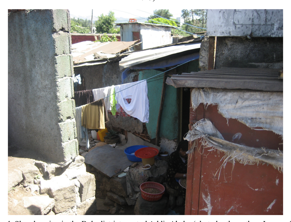
Figure 4. Slum housing in the Bole district, central Addis Ababa (photo by the author, January 2013)

In all fairness, Addis Ababa has its growing middle class, mostly small and medium business owners and young educated professionals working for international businesses and financial services, whose arrival is signaled by a fast growth of gated communities and apartment high-rises. According to the African Development Bank, thirty-four percent of African workforce was earning middle class incomes in 2010 compared to twenty-seven percent of Africans in 2000 (The Rise of Middle Class in Africa, 2013). Of course, these numbers differ from country to country, and the highest numbers of the middle class income earners are found not in Ethiopia but either in North or South Africa; however, in Addis Ababa this presently small group of residents has already