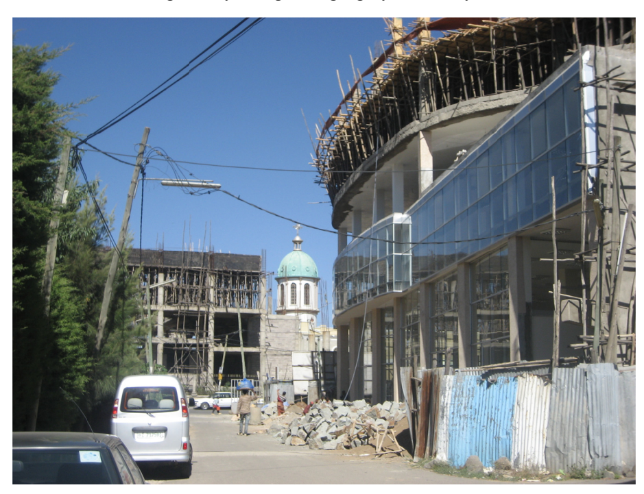
Figure 5. Unfinished residential and office buildings next to the Bole Medhane Alem Church, central Addis Ababa (photo by the author, January 2013)