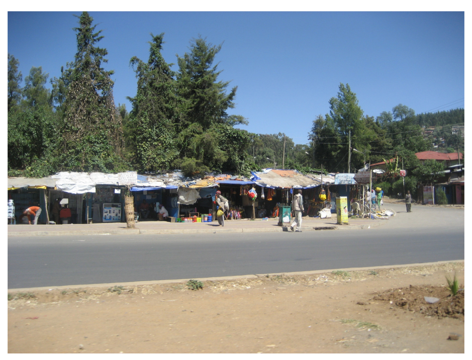
Figure 2. Informal businesses lining up one of the central streets in Addis Ababa (photo by the author, January 2013)

Union, Addis Ababa presents a host of foreign embassies and the recently constructed Headquarters of the African Union, a two-hundred-million-dollar project donated by the Chinese government, constructed by the Chinese workers, and inaugurated in 2012. There are also Addis Ababa University founded in 1950 and currently enrolling forty thousand students, the National Museum of Ethiopia founded in 1958 as part of the Institute of Archeology and exhibiting the reconstructed skeleton of famous Lucy, our three-million-year-old female ancestor discovered in Ethiopia, and the Holy Trinity Cathedral built to commemorate the liberation of Ethiopia from the Italian occupation during WWII and now the burial place of the last Ethiopian Emperor Haile Selassie. Reflecting the country's religious sixty-forty percent split between the Christians (the majority being the Ethiopian Orthodox) and the Muslims, Addis Ababa exhibits a vast variety of churches and mosques.