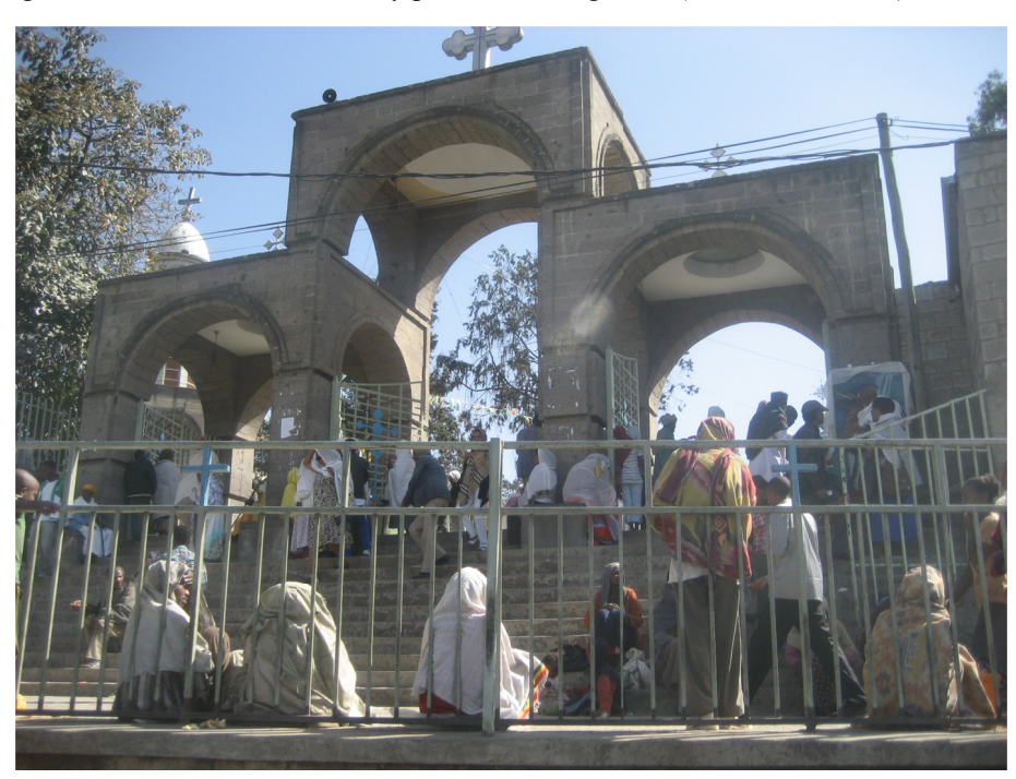
Figure 1. Asking for help at the church entrance, central Addis Ababa

Addis Ababa, the capital of Ethiopia, is the tenth largest city on the African continent, with 3.4 million residents in the city proper and 4.6 million in the metro area (Ethiopia Population, 2015). It is Ethiopia's primate city hosting thirty percent of the country's urban population. Addis Ababa has been the ninth fastest growing African city, with a 4.1 percent growth rate between 1990 and 2006 (UN-Habitat, 2010). Its population has, in fact, tripled since 1980 but is considered largely underestimated (Adugna, 2008; Myers 2011, 52). The high rate of rural-urban migration accounts for around forty percent of this growth (UN-Habitat, 2010).