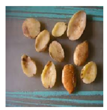
Figure 1. Irvingia gabonensis

In recognition of the many dangers of aflatoxins, researchers and farmers around the world are seeking an understanding of how to manage the contamination dangers resulting from them. Meanwhile, policy makers are in the process of balancing food safety with food availability, a task requiring a thorough risk assessment and monitoring as well as empirical data. In view of the fact that foods from maize ( Zea mays ), melon seed ( Colocynthis citrullus ), ground nut ( Arachis hypogea ), bush mango ( Irvingia gabonensis ) and red pepper ( Caspsicum frutescens ) are consumed in a high rate in Nigeria, it is important to ensure that foods consumed are of premium quality of zero or minimal levels of aflatoxin and other contaminants. This is because people are as healthy as the food they eat. In addition to this, food adds to the economical income of man but unacceptable aflatoxin levels could pose a threat to this opportunity. This work was designed to assay for the aflatoxin contamination associated with some foodstuffs sold in Calabar urban with a view to enlightening the consumers on the need for proper food handling.