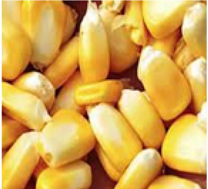
Figure 5. Zea mays