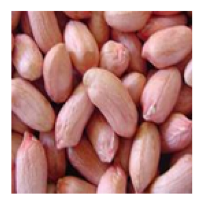
Figure 4. Arachis hypogea