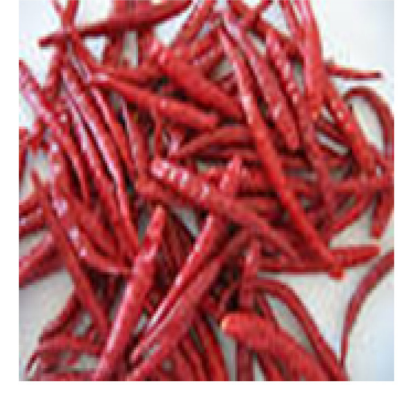
Figure 2. Caspsicum frutescens