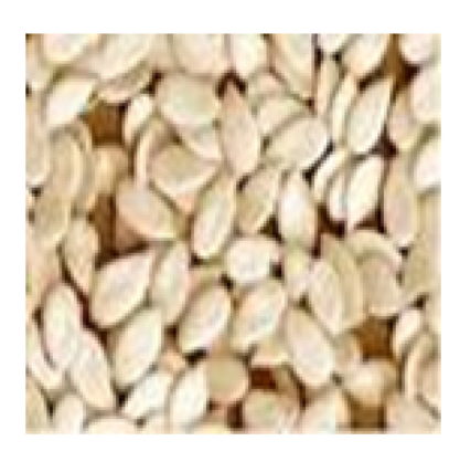
Figure 3. Colocynthis citrullus