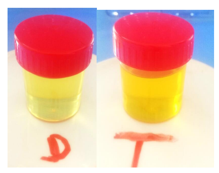
Figure 1. Oils extracted from the variety Dura (OD) with yellow light color and from the variety Tenera (OT) with orangey yellow color