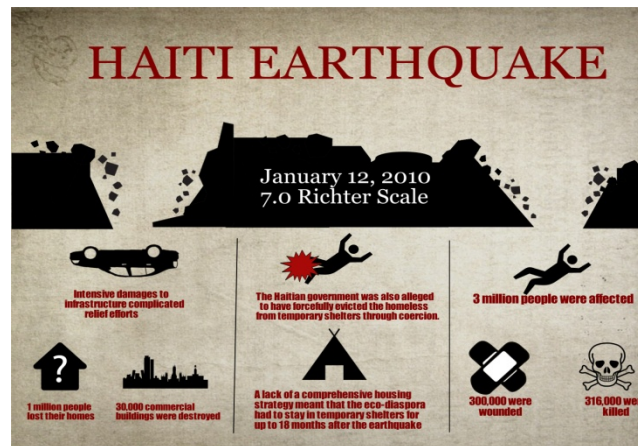
Figure 2. Haiti earthquake

This study was carried out to determine whether infographics used as instructional materials in geography lesson lead to significant difference in academic achievement and attitudes. The study is of great significance as it will make a new contribution to instructional materials that can be used in lessons. With regard to this topic, there are studies by İslamoğlu et al. (2015), Kibar and Akkoyunlu (2015), Yıldırım et al. (2014), Zedeli (2014) studies in Turkey and studies carried out abroad include studies by Dick (2014), Lankow et al. (2012), Matrix and Hodson (2014), Rajamanickam (2005), Smiciklas (2012), Weinschenk (2012) and Williams (2002). However, these studies are developed for educational purposes, communication and daily life. This study sets an example for use infographics especially for geography education. It is also considered that this study will contribute to the world of science as it will be point of reference for further studies.