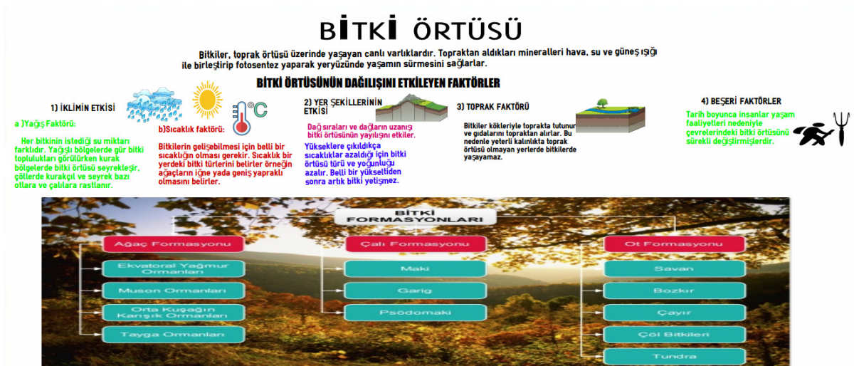
Figure 3. A sample of infographics used in the study

The infographics have been developed using on-line info-graphic development tools and according to the achievements in the topics covered in 10th grade geography course: “water, soil and vegetation” (Figure 3). Before the study, necessary permissions were taken from the school administration and the teachers. The researcher first held a meeting with the teachers about the rationale and importance of study and how to use materials. Later on, the researcher and teachers gave information to the participant about the study and made a short presentation. The study lasted 6 weeks. At the beginning of the study, achievement and attitude test were administrated. While courses were taught with infographics in the experimental groups, in the control groups the usual materials and methods were used. At the end of 6 weeks, achievement test covering the topics studied and attitude scales were administrated to the experimental groups and the control groups. The results have been detailed in the findings section.