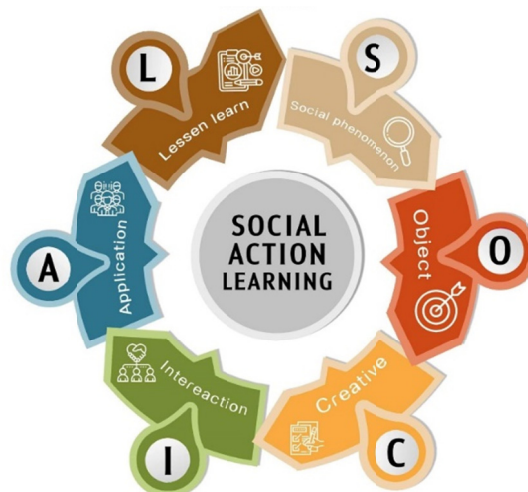
Figure 2. SOCIAL Action Learning (SAL)

Having designed and developed the handbook, essential finding is the outcome of participatory action learning, “SOCIAL Action Learning Model” , as having