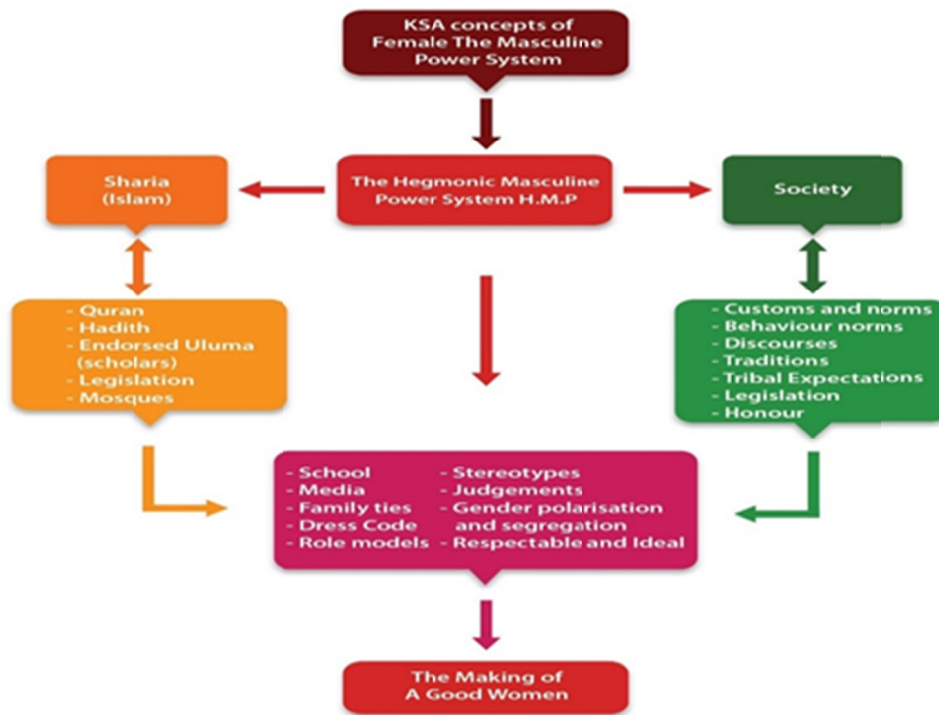
Figure 2. The making of a ‘good woman’