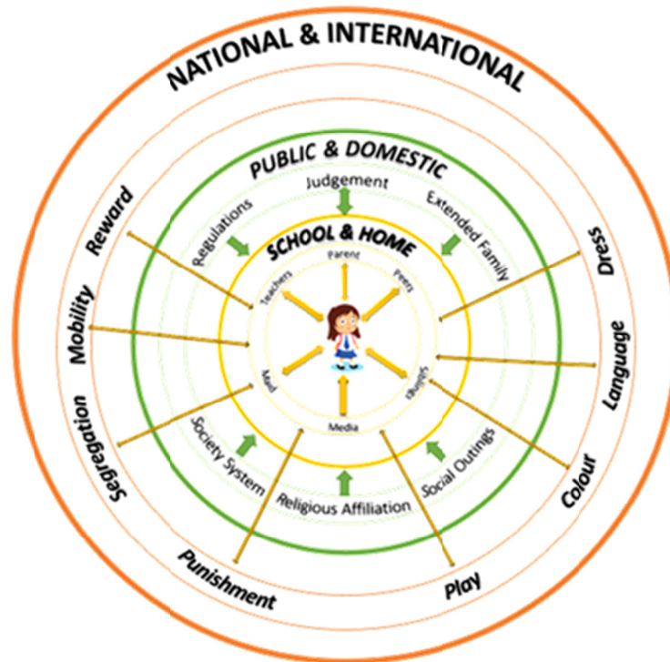
Figure 3. The arenas through which young girls are shifting