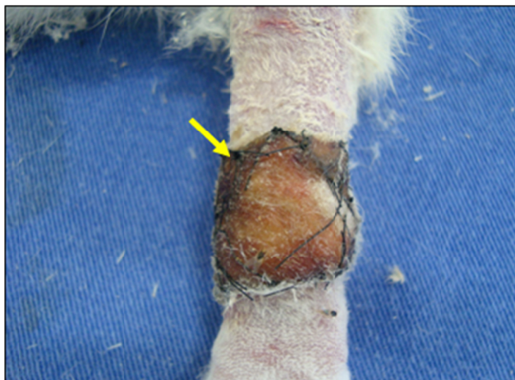
Figure 1. Images of the lesion in the left forelimb in carpal region of rabbits ( Oryctolagus cuniculus ) showing the necrosis macroscopic variables (Arrow) with 15 days that were submitted to the reconstructive surgery procedure at the Veterinary Hospital Faculty of Agricultural and Veterinary Sciences (FCAV) of UNESP, Jaboticabal Campus, 2015

According to Pavletic (2007), wounds that have difficulty in healing by primary sutures should be treated with reconstructive techniques which can be either adopted flaps or skin grafts for correction. The use of these techniques is a useful therapeutic alternative to reconstructing injuries resulting from trauma, removing tumors, or ischemia.