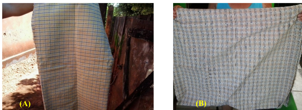
Figure 2. Cotton fabrics handmade from the fiber of cotton G. barbadense the municipalities of Palmelo (a) and Pires do Rio (b), Goiás

The use of arboreal cotton for spinning of handmade fabrics, used mainly for the production of blankets, as illustrated in Figure 2, is a rare habit (Table 1). In the reports of the various expeditions carried out by Embrapa in recent years (Almeida et al., 2009; Barroso et al., 2005) commercial production was nonexistent and was reported only in one site located in the city of Cuiabá, MT. This crop was composed of a bulk of local seeds, the production of which would be sold, but the commercial activity of this type of cotton had already been abandoned in the region (Barroso et al., 2005). The commercialization of arboreal cotton is registered by IBGE (IBGE, 2015), and includes mocó cotton ( G. hirsutum var. marie galante ), which is predominant. It was abandoned gradually, since in the 90s 554,000 ha was cultivated, not leaving in 2014 any area for harvest, according to the IBGE.