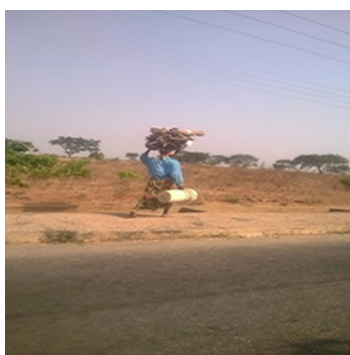
IV. Human transport (Head portage)