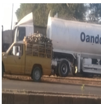
II. Pick up van