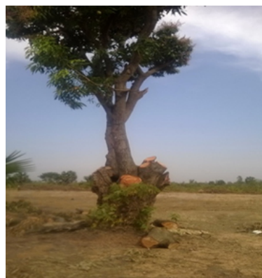
XIII: A forested area cleared for agriculture