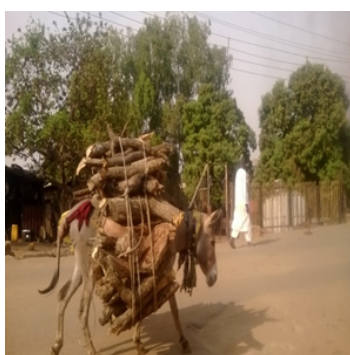
I. Animals (donkey)

Table 3 also reveals that A, B and C categories were basically branches and stems of trees, they constituted 69% of the total wood harvest from the study forest; in the D and E categories stems or roots constituted 31%. The remark column reveals that most of the wood harvested was stem, probably associated to the wood merchants no longer systematically harvested only matured trees, rather they also search every type and size of wood on their way, from shrubs to very big trees. It is relevant to point out that a large percentage of D and E categories, which constituted 31%, consisted of a very large proportion of tree roots, while branches of trees constituted the remaining categories. In general, these descriptive statistics indicated that most of the wood harvested in the forest area was more of stems followed by branches, then root. This is an unusual situation in modern day forest management, where trees are mostly trimmed and not completely uprooted thereby not just removing the vegetation, but also exposing the soil to all manners of degradation, such as erosion.