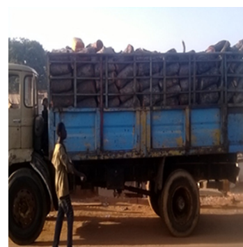
VI. Semi-trailer (Gongoro)