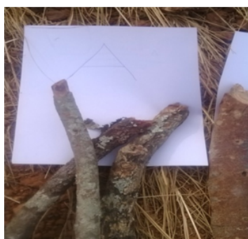
VII. A ( \leq 5.0 cm)