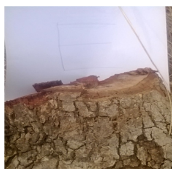
XI. E ( \geq 20.1 cm)