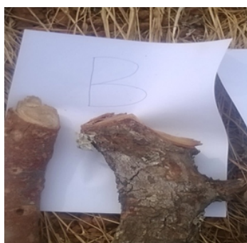
VIII. B (5.1-10.0 cm)