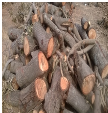
XII: A whole large tree harvested

The rate of fuel wood harvesting from Afaka Forest Reserve has diverse effects on the forest ecosystem. For instance, the field study of the forest area showed that there was now an increase in the spacing between trees in many areas, and consequently there was no continuous canopy of trees in many parts of the forest (Image XIII). The wider spaces have given room for farming activities by some farmers within the forest (Image XIII). The effects of the increase in spacing between trees also exposed the soil to the direct effect of rainfall and other interaction such as track/path now used by heavy vehicles to collect fuel wood have led to soil compaction, this effect, which may not be visible now, but would sooner or later, begin to manifest in the form of environmental degradation such as flooding, soil erosion, destruction of wild life habitat and decrease in plant and animal diversity in the area. This finding supports some of the positions taken by Adewuyi (2011) and Adewuyi and Baduku (2012) in their studies in the areas adjacent to the study forest.