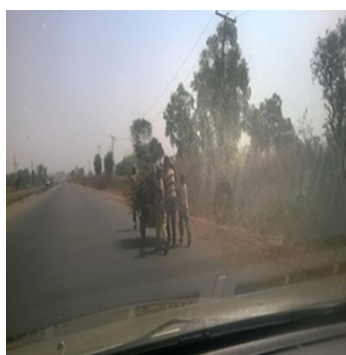
V. Wheel barrow