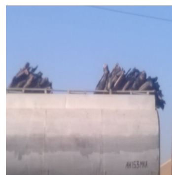
III. Top of tank trailer