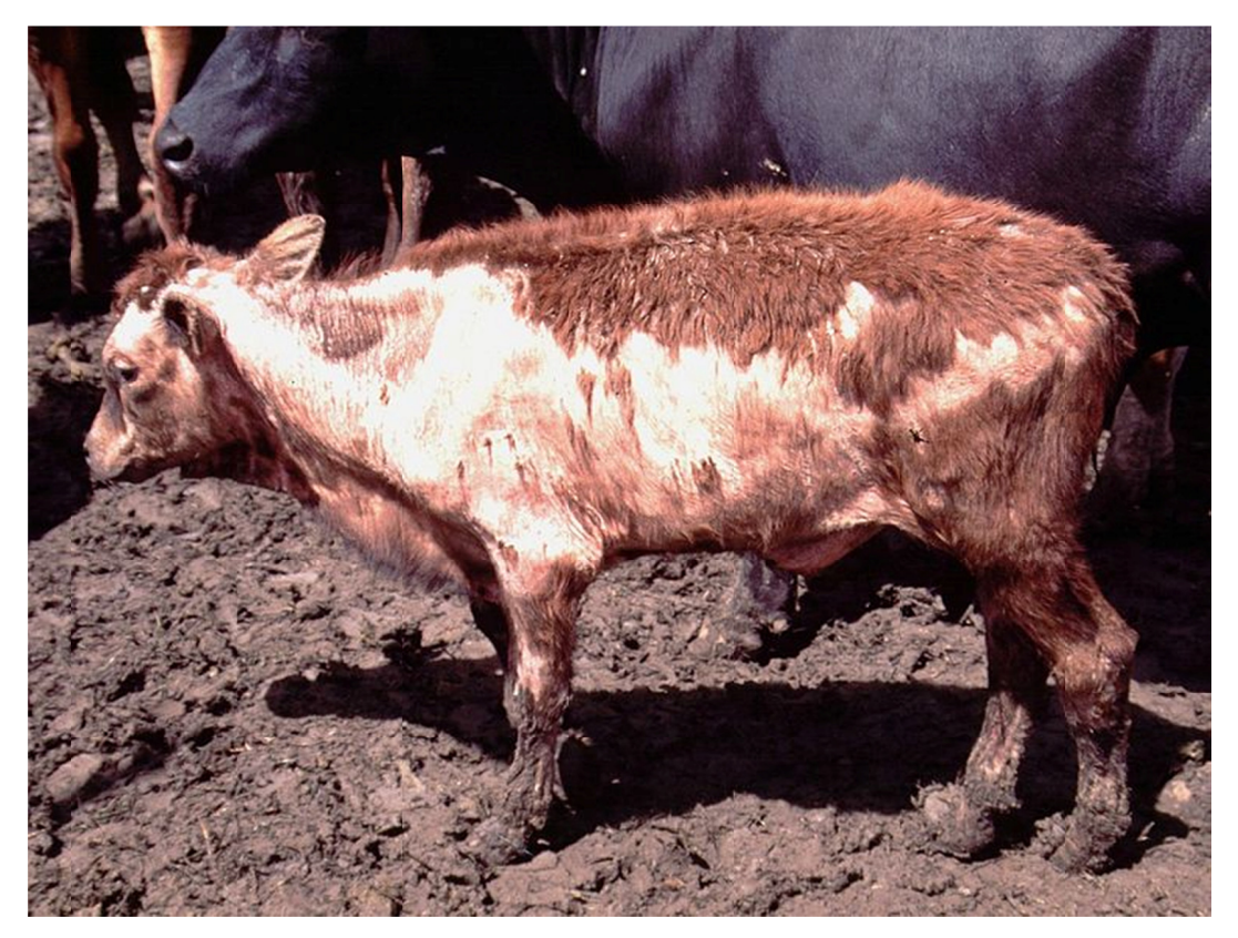
Figure 3. Calf showing signs of sweating sickness

A moist eczema, sometimes with hair loss (= alopecia) known as sweating sickness in cattle (Figure 3) is caused by Hyalomma truncatum and this paralysis can be life threatening (Stone, 1989). Because ticks feed repeatedly and only on blood, and have long lives, they are suitable hosts for many types of microbe. The microbes exploit the ticks for transmission between one domestic animal and another. Amblyomma variegatum adult ticks which feed on cattle cause a systemic suppression of immunity in the host making dermatophilosis to become severe or even fatal (Martinez, 1993).