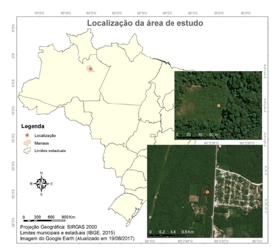
Figure 1. Location of the experimental area (EEFT), km 45 da BR174, Manaus, Amazonas, Brazil

Before the area opening, the existing vegetable composition was a 30-year old capoeira, which was removed in 2003 and shortly before the installation of the experiment in 2006, using conventional cutting techniques and without burning the residues, aiming later to test the effects of increasing doses of biochar on the soil. Thus, in the beginning of 2006 there was a delimitation of the experimental area according to the total area felled (0.44 ha).