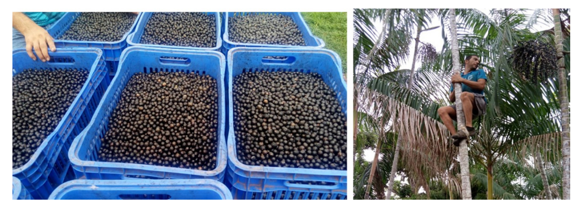
Figure 3. Production and extraction of Açaí, from producers in the municipality of Abaetetuba, Pará, Brazil

Another important point that is worth mentioning is that the Açaí palm allows the maximum of everything that is produced in the palm, which ranges from the fruit, palm heart and even the core of Açai that has been used in the jewelry, cosmetics, and civil construction segments and also the leaves that are used to cover the houses (Bastos Tagore et al., 2019; Pinto et al., 2020). Figure 3 represents the product under discussion.