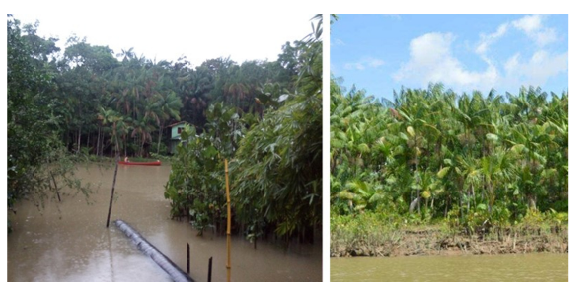
Figure 4. Açaí planting in a lowland area, in the municipality of Abaetetuba, Pará, Brazil

Therefore, the production chain was benefited from State programs and financing agents such as PRONAF, which is offered by BASA, SEDAP (Secretariat for Agricultural Development), EMATER-PARÁ and other financial incentives to be applied to ensure sustainable production So, understanding the costs involved in managing the Açaí production is important so that producers can see the benefits of production based on appropriate techniques (Figure 4).