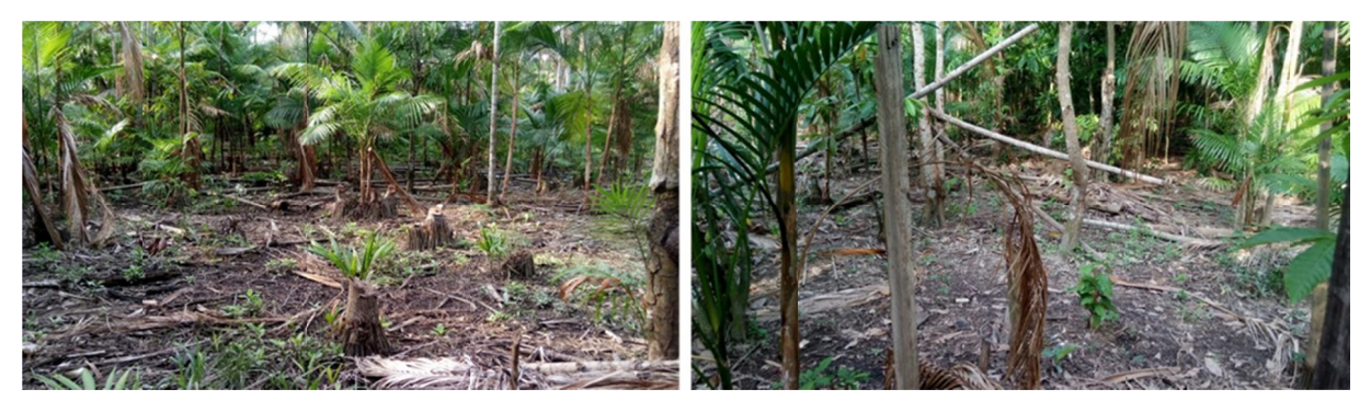
Figure 2. Açaí production management area in Abaetetuba, Pará, Brazil

In this context, the economic valuation of Açaí should be in agreement with Tagore, do Canto and Sobrinho (2018) also financed and promoted with the implementation of public policies of the state, which have purposely led to the implantation of plantations and management models that jeopardize the environmental balance where they are settled.