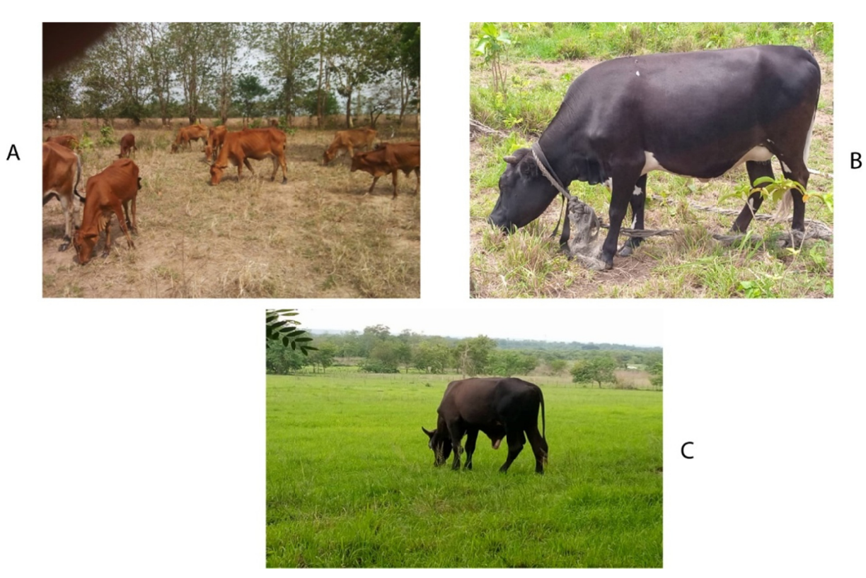
Figure 1. Cattle breeds (A = Azawak; B = Muturu; C = Girolando)