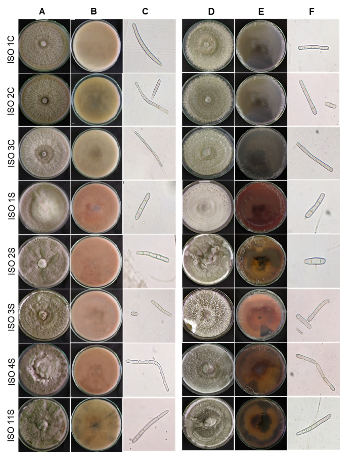
Figure 2. Morphological characteristics of Corynespora cassiicola isolates at 12 days of incubation in V8 juice agar and PDA culture media, T° = 25±1 °C and 12-hour photoperiod. (A) Front view of the dishes in Juice V8 agar medium; (B) Back view of the dishes with V8 juice agar medium; (C and F) Microscopic images of different shapes, septa and conidia sizes of C. cassiicola visualized in juice V8 agar and PDA; (D) Front view of the dishes with PDA medium; (E) Back view of the dishes with PDA medium