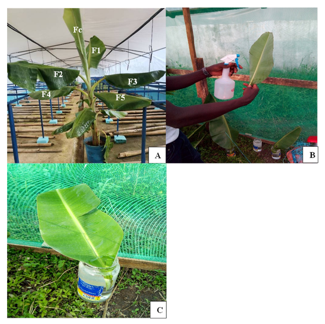
Figure 3. Treatment of plantain leaves using biocontrol solutions.

using a calibration line made with gallic acid (y = 0.021x + 0.053; R<sup>2</sup> = 0.999; where y is absorbance and x is the concentration of gallic acid). Each measurement is repeated three times.