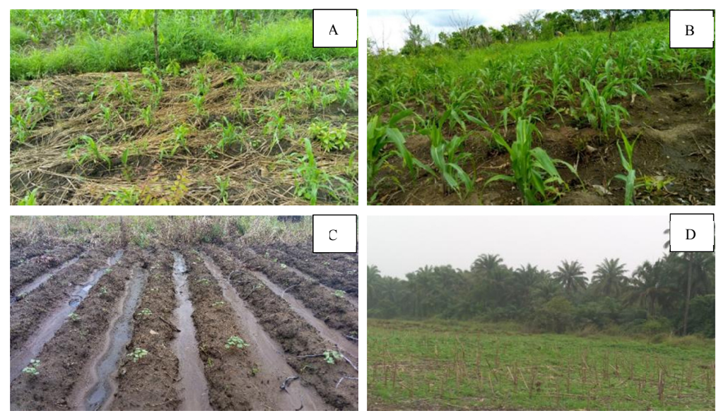
Figure 4. Inventoried soil erosion control practices: (A) Mulch made with couch-grass; (B) Isohypse ridging; (C) Ridging made following the slope; (D) No-tillage practice

The specific adoption intensity of the SEC practices is presented in Table 4. It can be observed that adoption intensity ranged from 8% (no-tillage) to 41% (Ridging parallel to the slope). The cumulative intensity of adoption of the four practices inventoried is about 77% used at least of one soil erosion practices. However, no-tillage and mulching are the least adopted practices. The SEC inventoried can be grouped into two broad categories: (i) practices acting on land cover and (ii) practices affecting tillage. The first category includes mulching (Figure 4A). The second category includes isohypse ridging (Figure 4B); Ridging parallel to the slope (Figure 4C) and no-tillage (Figure 4D). The Ridging parallel to the slope is a type of tillage whose seedling lines are oriented parallel to slope direction. Isohypse ridging designates a type of ridging made following the contour lines. Mulching is one of the most important soil and water conservation technics. In the study area, the mulch is made of crop residues and weeds mown during soil preparation. The no-tillage practice consists in direct sowing without any actual soil work. The seedling poop are made with a machete or hoe on a depth proportional to seed size.