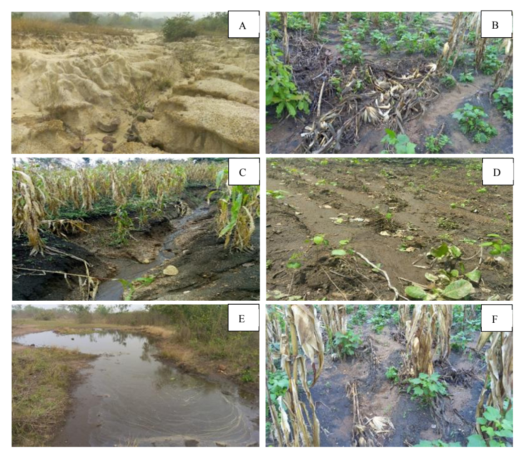
Figure 3. Soil erosion indicators observed: (A) Rill; (B) Fall of crop; (C) Gull; (D) Ridges destruction; (E) Runoff; (F) Naked root of crop