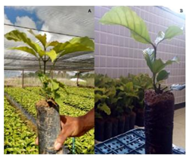
Figure 1. Conilon coffee tree ( Coffea canephora Pierre ex Froehner), LB1 clone, evaluated 90 days after the stacking (A = Seedlings in nursery; B = Seedlings in the breeding lab for the attainment of evaluations)

As for the destructive characteristics, the quality evaluation showed the average value of DQI = 0.68 (Table 1), similar to what was observed by Dardengo et al. (2013), that found the value of DQI = 0.60. In the evaluation of the conilon coffee tree the average value of TDM found was of 3.22 g, the same way that the values of DQI presented similar to the ones by Dardengo et al. (2013), that being of 2.99 g, which according to the same represents a good level of development for the plant. The dry matter of the aerial part presented the average of 2.41 g, that being superior to the value of 1.28 g found by Espindula et al. (2015) and inferior to the value of 3.6g found by Berilli et al. (2018). The dry matter from the root had the average of 0.81 g, with the average value close to what was found by Berilli et al. (2018), that being of 0.99 g, appointed by the same as representative of good radicular development of the plant.