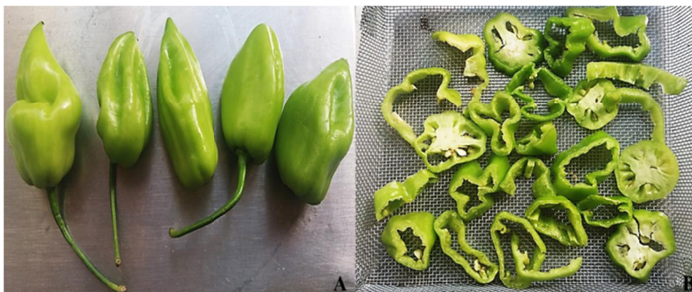
Figure 1. Whole and sliced chili pepper

The work was carried out in the Laboratory of Storage and Processing of Agricultural Products, Federal University of Campina Grande. The chili peppers used were acquired in the commerce of the city of Campina Grande, Paraiba, Brazil, then they were selected visually as for the elongated appearance of intense and bright green color for sampling uniformity (Figure 1A), cut into thin slices and the seeds were removed (Figure 1B).