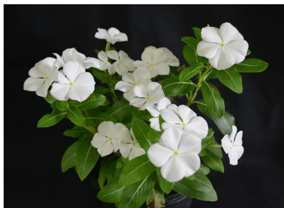
Figure 1. Catharanthus roseus (L.) G. Don

production by producing of phytoalexins and the generating of hydrogen peroxide (Abd-Allah & Hashem, 2006). Chitosan has been confirmed as an effective biotic elicitor for improving biosynthesis of secondary metabolites in cell cultures of several medicinal species. The main aim of this study was to examine the effects of chitosan elicitation in the C. roseus cell suspension culture, accumulation of vinblastine and vincristine. Moreover, to find the feasible relations between plant chitosan concentrations and vinblastine and vincristine accumulations under chitosan elicitation.