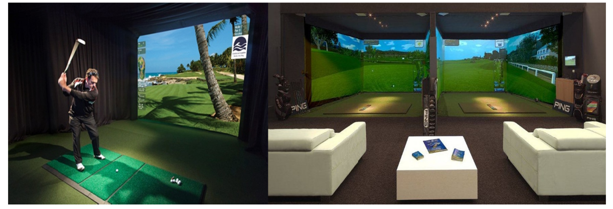
Figure 1. Golf simulation system at an indoor virtual reality golf center

impact to how the ball bounces visually on screen. In this way, the golfer has a detailed analysis of the entire flight of the ball which can be used for practice or training. It utilizes a projected landscape, sometimes with natural images. A computer calculates the expected trajectory of the golf ball from data gathered on the swing, and the image of the golf ball flight is then simulated on the screen via a projector. Golf simulators need to present club speed, club path, club face angle at impact, ball speed, ball path, horizontal and vertical launch angle and spin. There are several types of measurement system used in golf simulation to achieve this, such as simulator mats, sonic sound systems, optical sensor arrays, radar and camera ball tracking systems and so on.